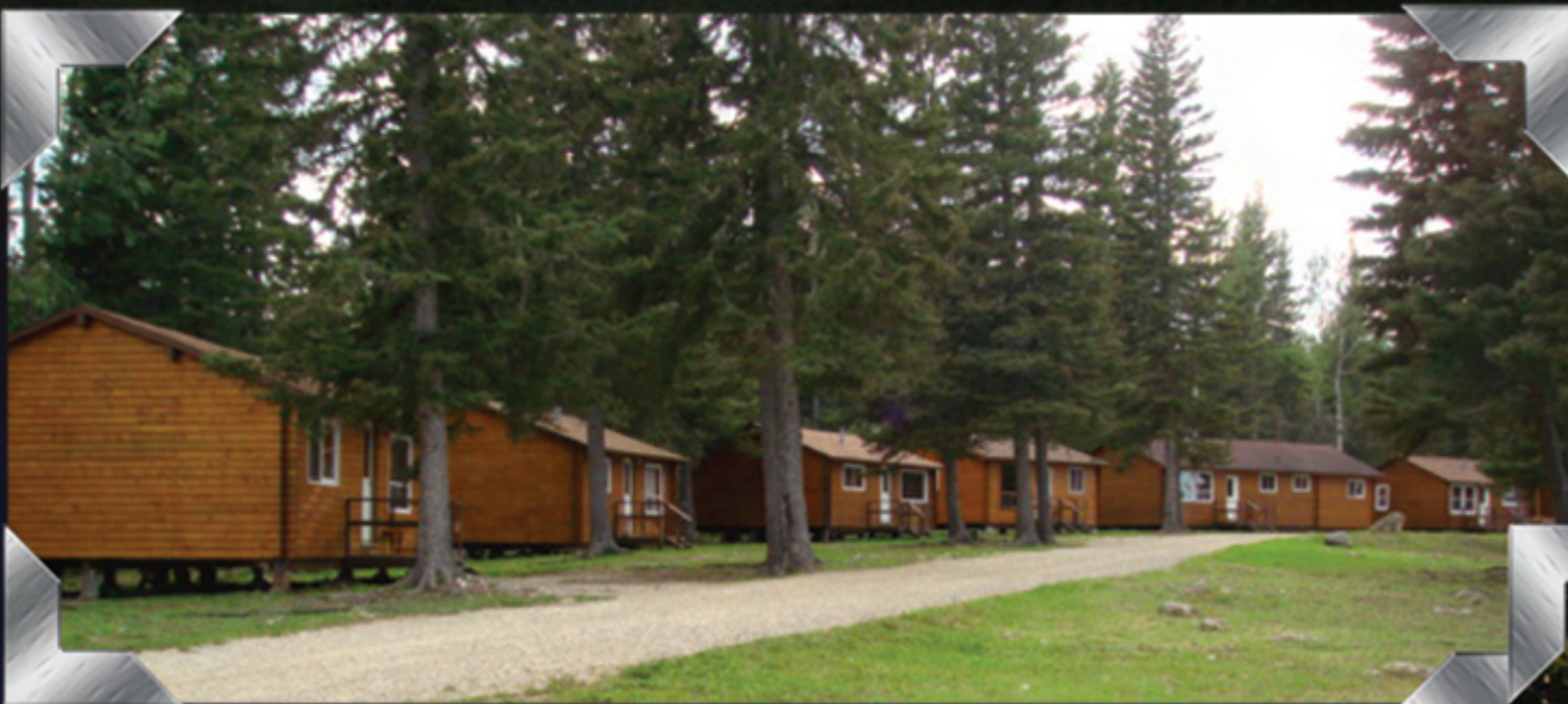
11 Five Star Cabins